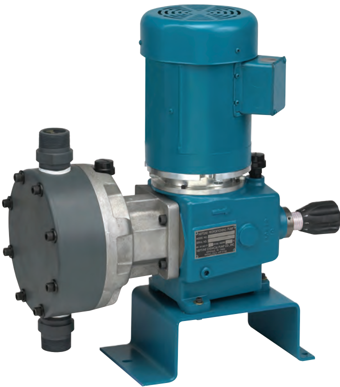
The Series 7200 mechanical metering pump from Neptune Chemical Pump.