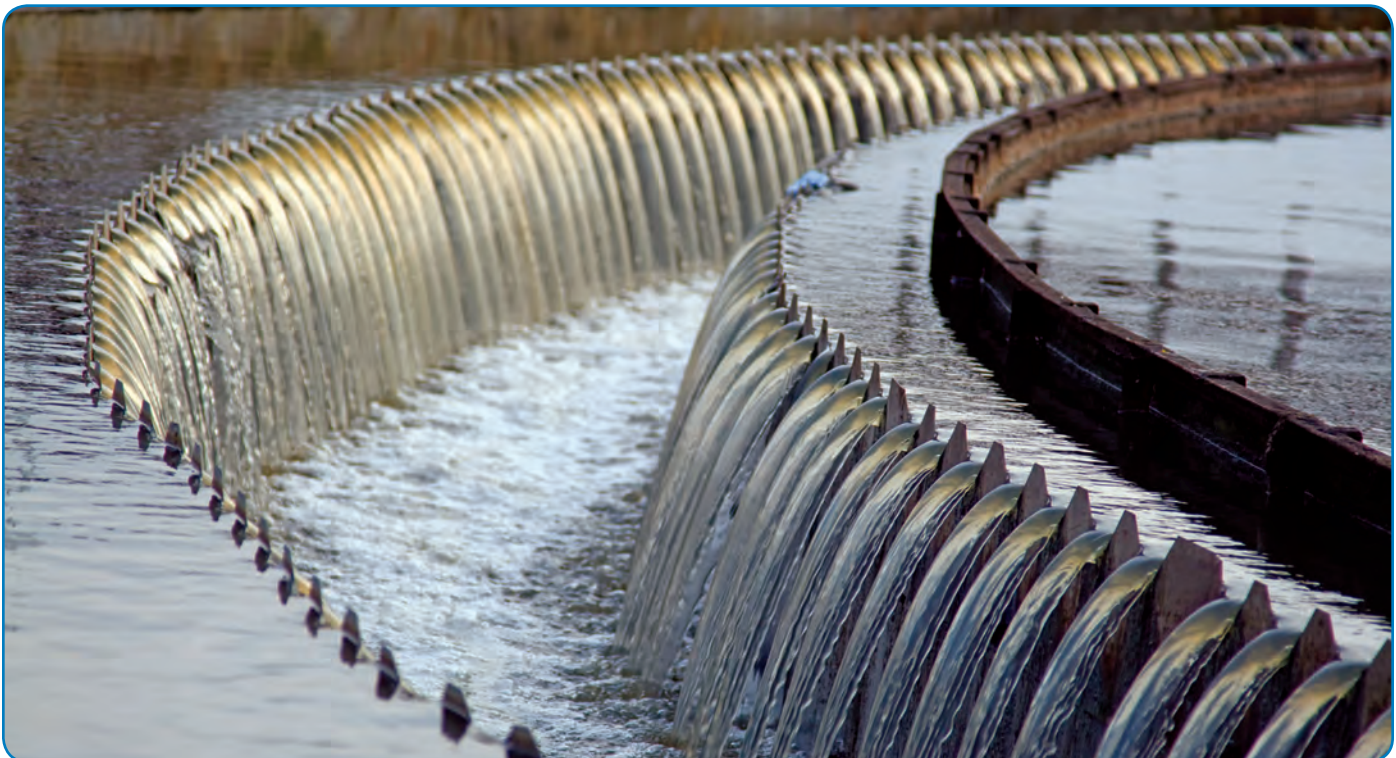
Wastewater waterfalls: secondary treatment of sewage or industrial wastewater through use of aerating mixers/diffusers.