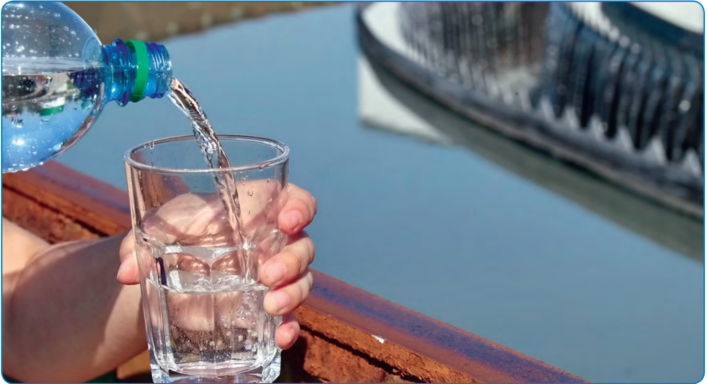
In the treatment of wastewater, sodium hypochlorite is introduced to the system via metering pumps.