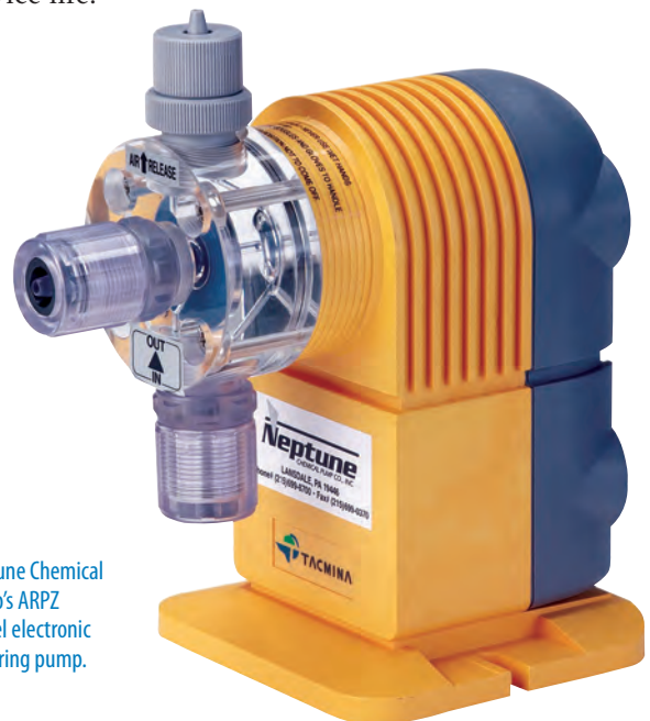
Neptune Chemical Pump's ARPZ model electronic metering pump.

to 300 gph, and can be provided with automatic frequency control. A micrometer dial can adjust capacity on the Series 7000 while the pump is running (10:1 turndown). They are available with flow rates from 6 to 300 gph at pressures to 150 psi. The Series 7000 pumps are available in PVC and Kynar® construction – which are most suitable for sodium hypochlorite applications – and all parts within the gearbox are submerged in oil for extended service life.