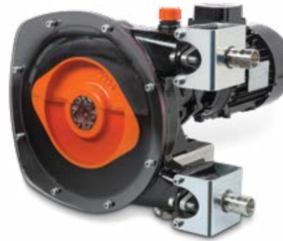
Abaque® Peristaltic (Hose) Pumps play a pivotal role in sludge removal during a wastewater-treatment operation thanks to their ability to run dry and effectively handle abrasive, particle-laden materials.

Industrial water or wastewater treatment, then, is a three-stage process that must work hand-in-hand: initial floc formation with alum and ferric chloride, clump-strengthening with polymer, and removal and disposal of the sludge. Not all manufacturers of wastewater-treatment equipment are able to offer full lines of pumping and polymer-blending technology for the required water-treatment applications.