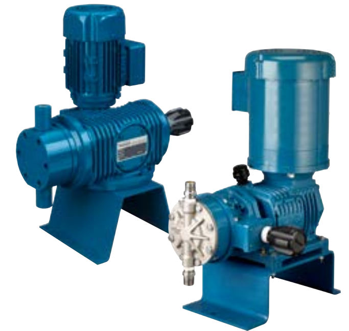
Neptune® MP7000 and MP7100 Series Mechanical Diaphragm Metering Pumps are ideal for dosing alum and ferric chloride because they do not feature contour plates on the liquid side of the diaphragm, resulting in a simple, straight-through valve and head design that allows improved flow characteristics.