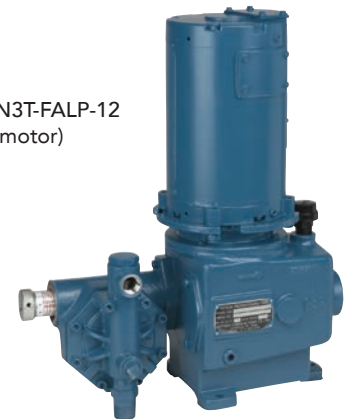
Model 535-VS-N3T-FALP-12 (12-volt motor)