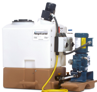
Neptune™ 500-VS Series High-Viscosity Hydraulic Metering Pump