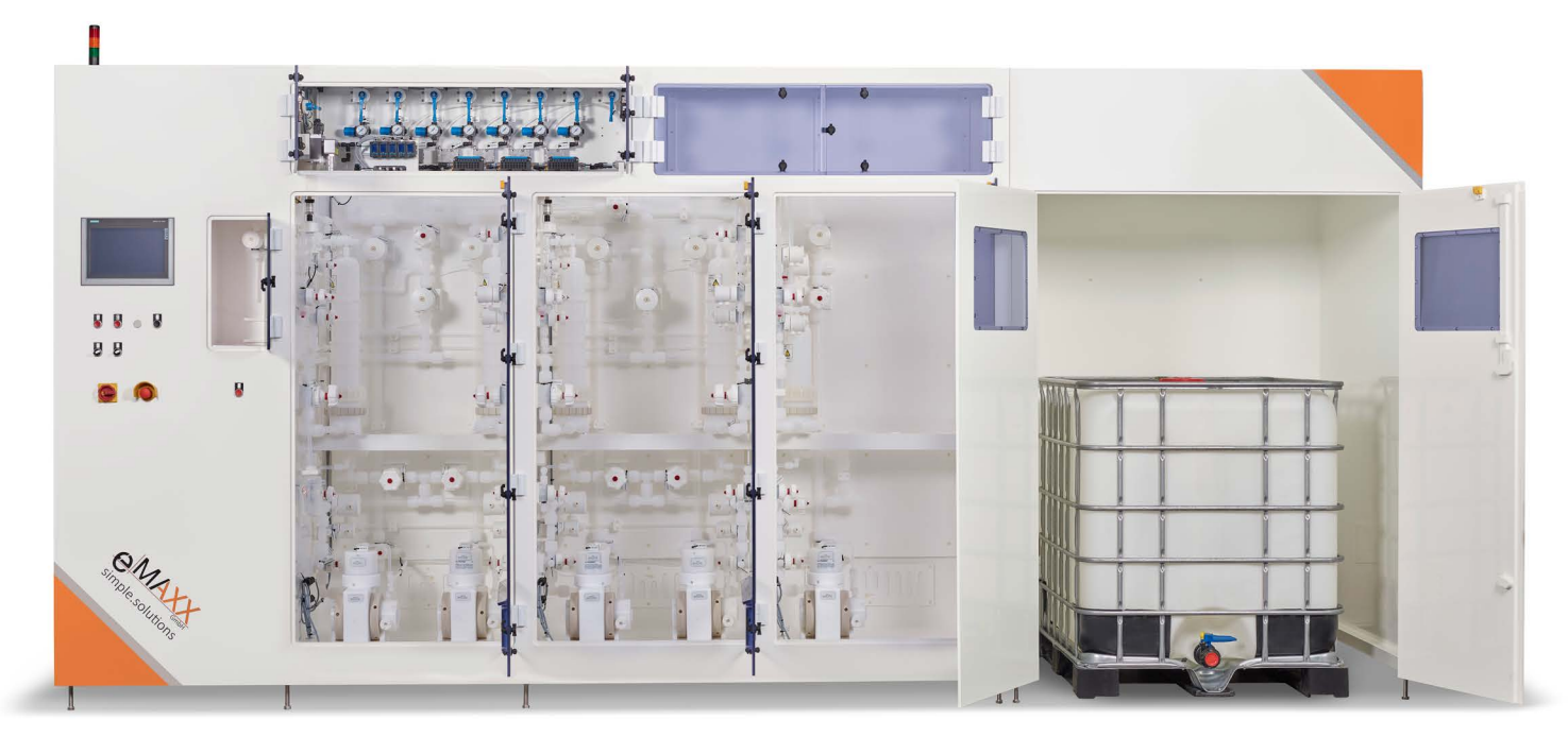
eMAXX specializes in the design and construction of chemical-supply systems for use in the various liquid-handling applications that are found in semiconductor manufacture.