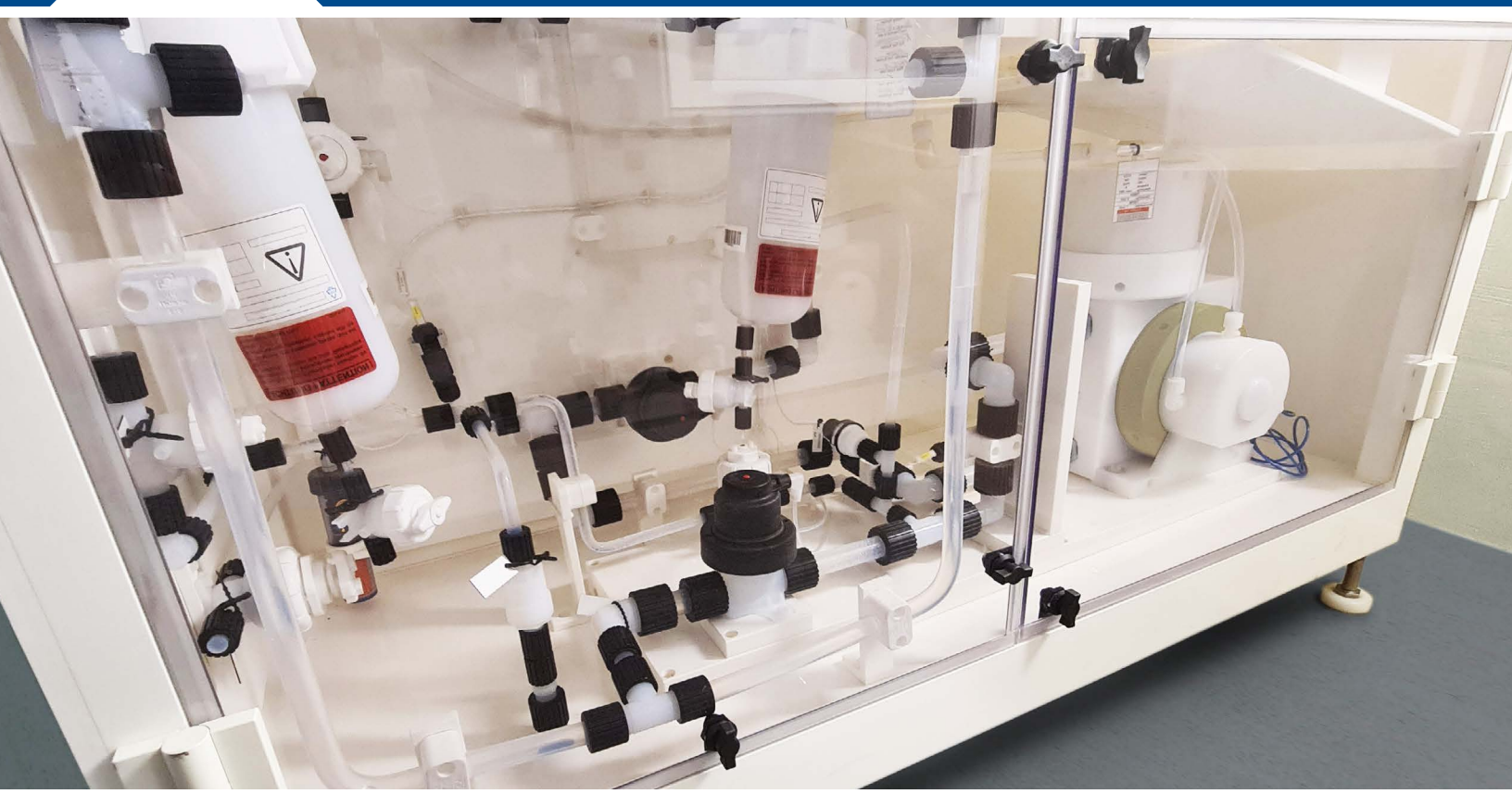
Since 1984, Almatec<sup>®</sup> has been developing air-operated double-diaphragm (AODD) pump models that possess the capability to supply and circulate high-purity chemicals, abrasive slurries and solvents in a wide range of industrial liquid-handling applications. A standout technology in this area is its FUTUR Series AODD Pumps, with a 100T model in the example above mounted in a cabinet and used to transfer chemicals to and from tank trucks and storage tanks.