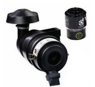
Suction Filter (optional)