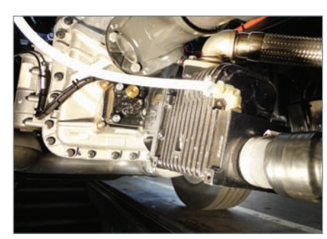
PF Option – PTO Flange Splined shaft for direct flange mounting on PTO