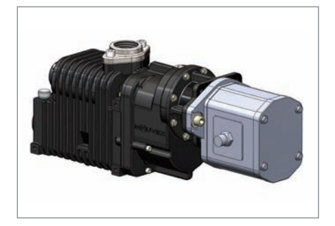
HY Option – Hydraulic Female spline shaft for hydraulic motor drive