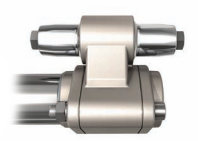
Flow Control Check and Relief Valve (delivered with B200 Flow Control)

The new B200 Flow Control comes from Mouvex, a trusted name in transport screw compressor technology. The Flow Control boasts a premium, robust, rugged design and has been enhanced with special protectants to allow it to work with a broader range of chemicals. And because it is flow optimized, customers can realize efficiencies not found in other vane compressors.