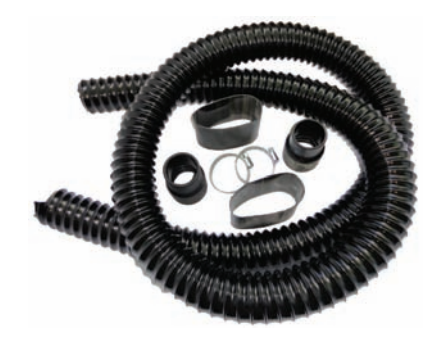
Inlet Connection Kit (delivered with B200 Flow Control)