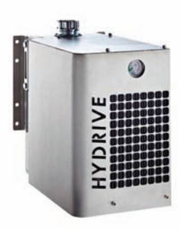
Hydrive Hydraulic Cooler (optional)